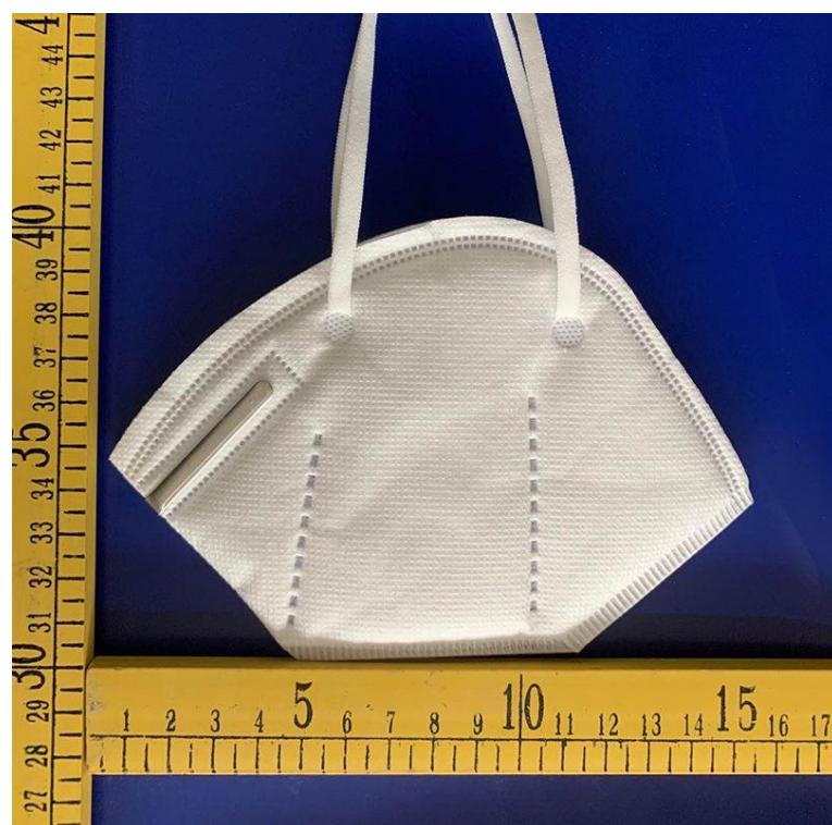
General view for MS-KN95-01