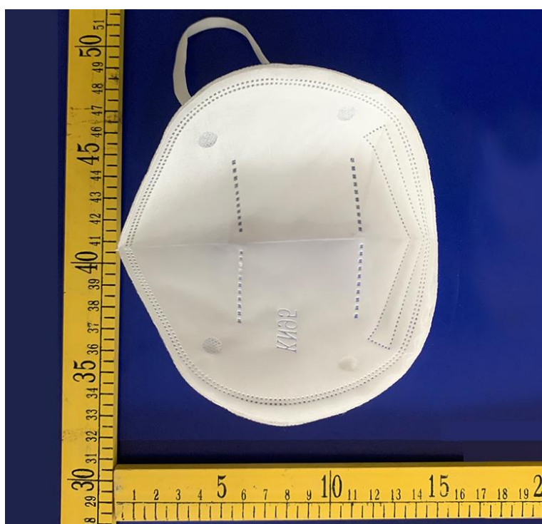
General view for MS-KN95-01