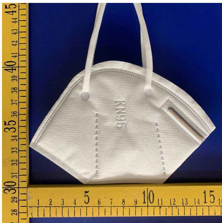
General view for MS-KN95-01