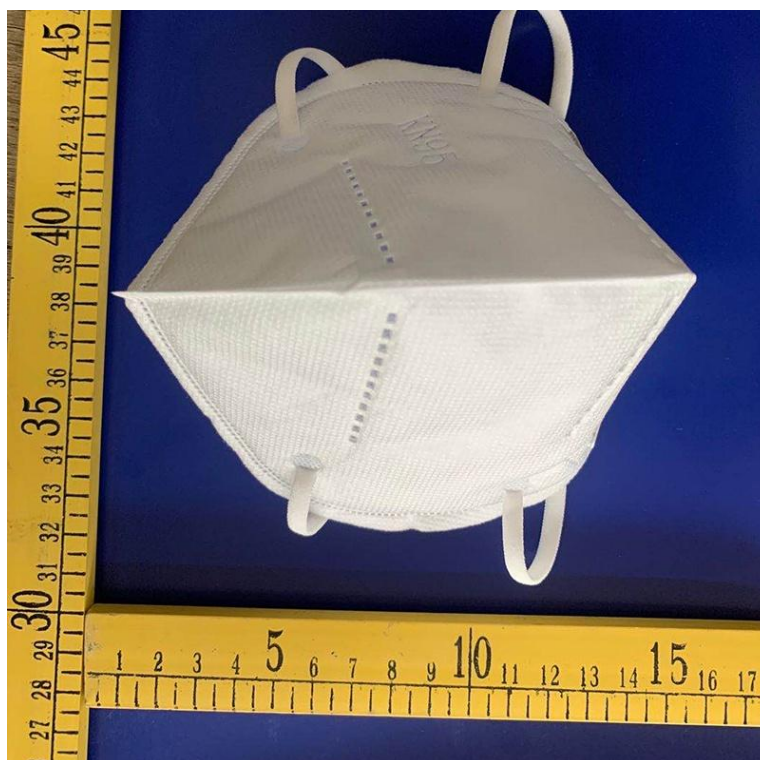
General view for MS-KN95-01